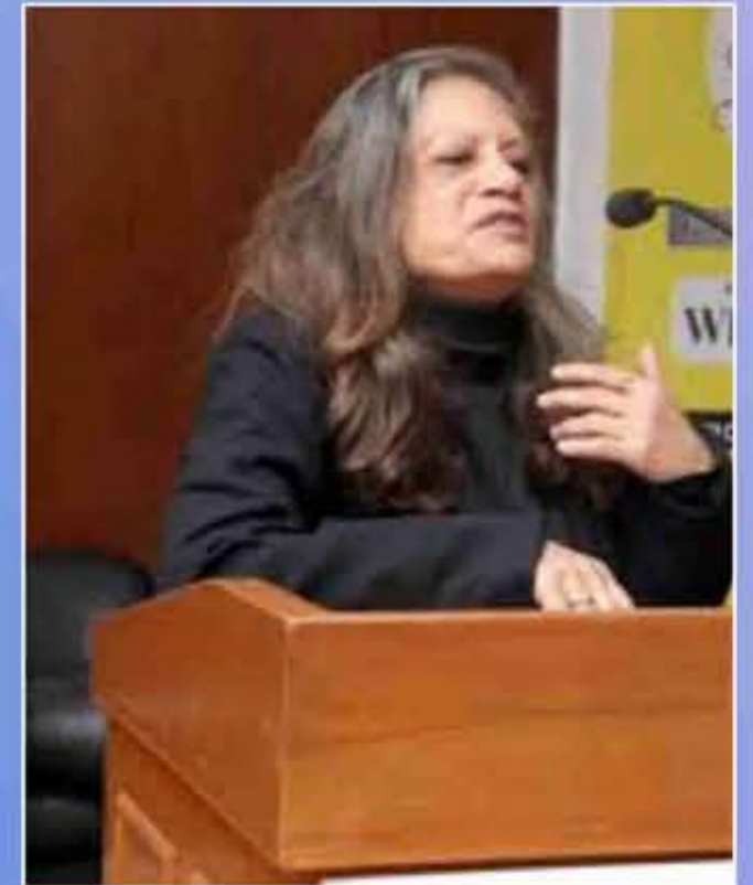
The person behind the successful lecture held