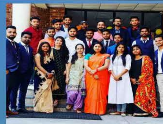
Emotions gathered in one frame

Yesterday brought the beginning, tomorrow brings the end, though somewhere in the middle we all became a family. A good one.