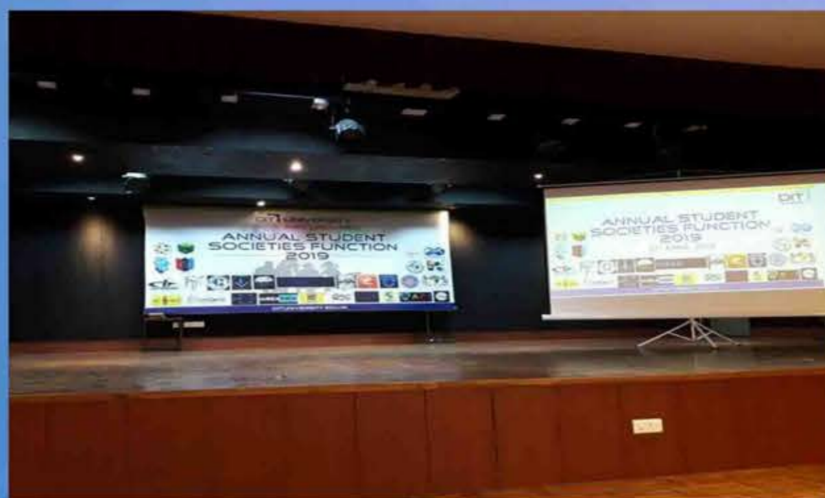
Glimpse of the ASSF