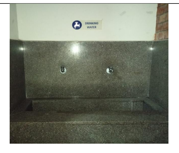
Upgraded version of Pressmatic Water Tap for minimizing water wastage