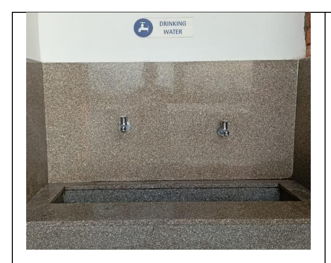
Rotational Version of water Tap Older version