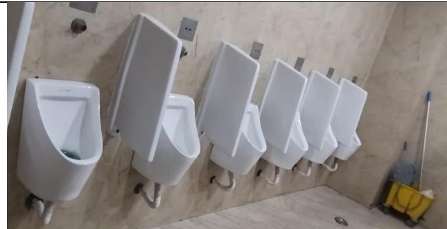
Daily Peridical Cleaning and Checking of Water Sink, Faucets, Closets to Maintain Hygiene and Prevent Water Wastage