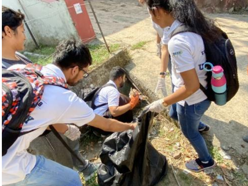
Photograph of the event.